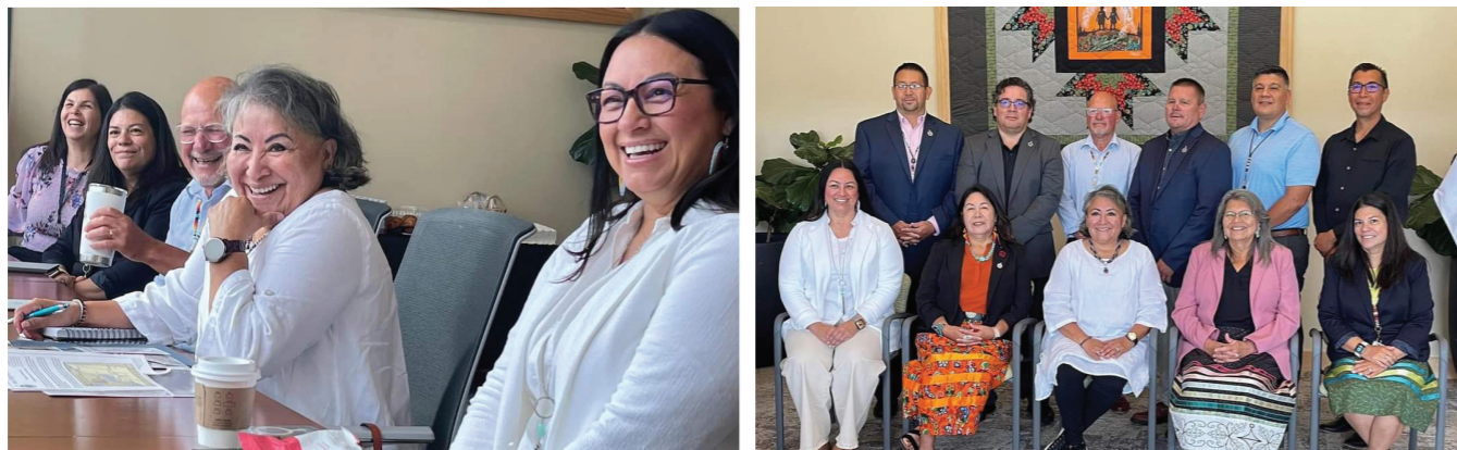
IHS Health Director Visit