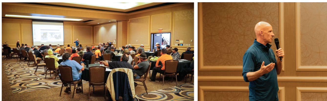
Snowplow Operators Training