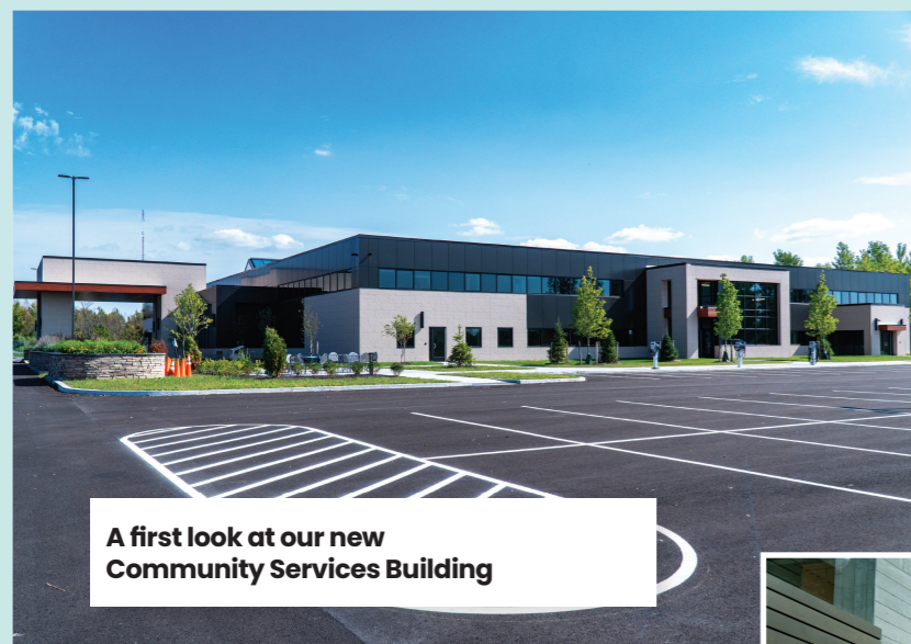
A first look at our new Community Services Building