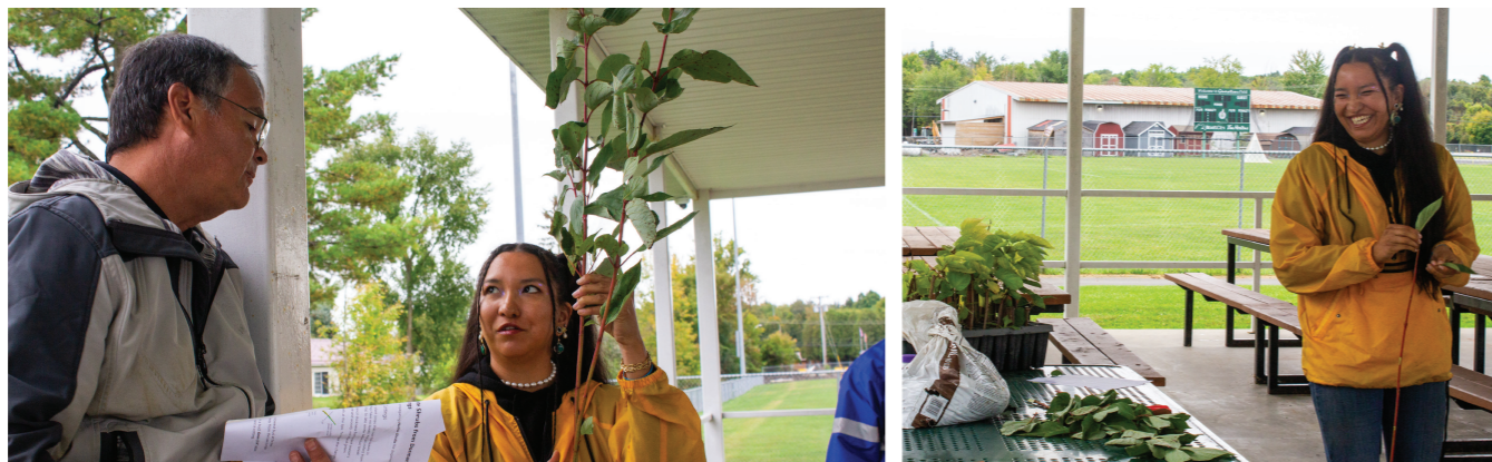
Native Plant Workshop