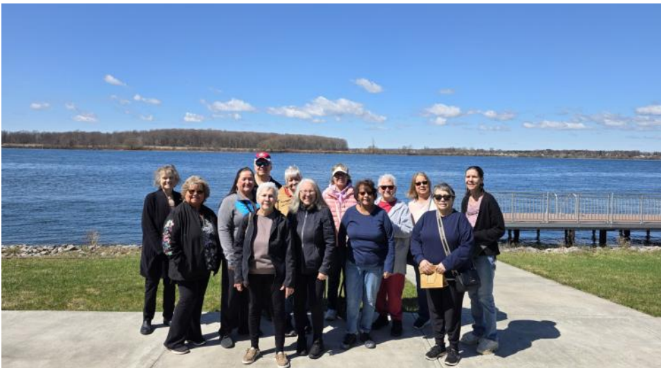
First Ride to Nowhere of 2026! We had 13 passengers jump on the bus with no idea where we were off to. They wound up in Waddington, NY and stopped at the Hepburn Library, walked down the street to the historic 'Clark House' art gallery then walked a little further to the beautiful St. Lawrence river side. With the sun shining— it made for a perfect spring day to be out exploring.